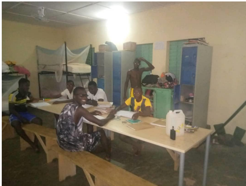
Boys in dormitory

We have been able to equip all dormitory of the LAP with solar energy.