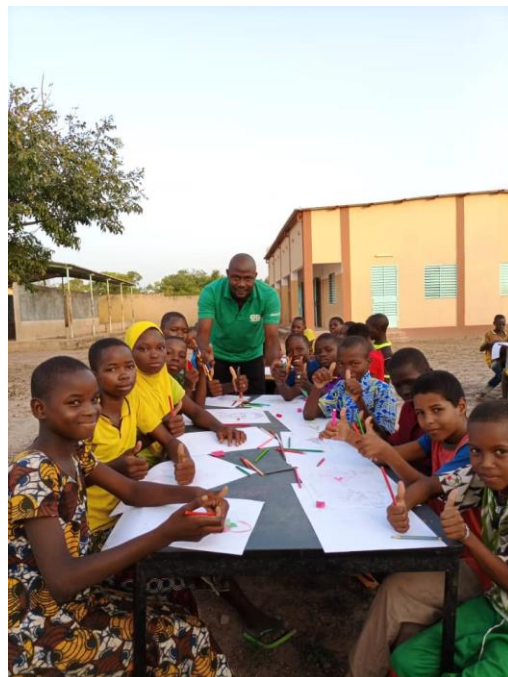
Week end activity: drawing